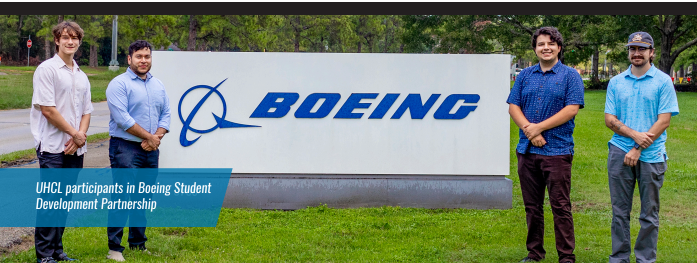
UHCL participants in Boeing Student Development Partnership