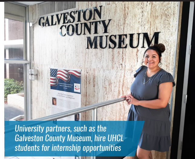
University partners, such as the Galveston County Museum, hire UHCL students for internship opportunities

Some internships are paid, while others are not, depending on the field. Unpaid internships can give students valuable experience and connections and many students find them to be an incredibly worthwhile investment, but ultimately it is a decision you will have to make for yourself after you have taken all factors into account.