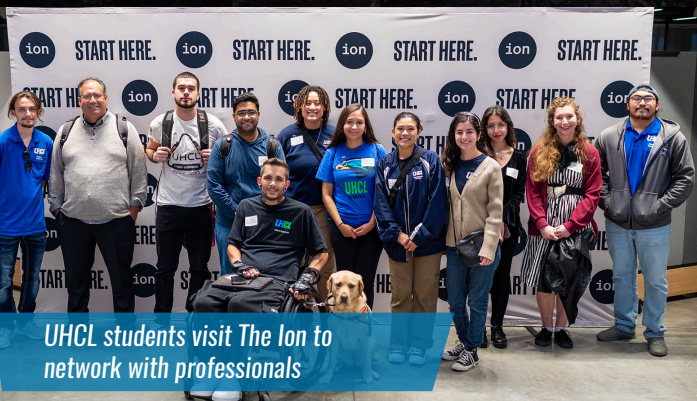
UHCL students visit The Ion to network with professionals