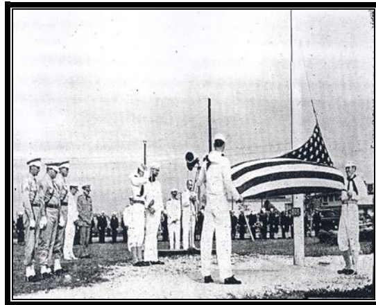
The Square Knot, Dec. 1944

On April 30 th 1944 at a joint ceremony the control of Camp Wallace was transferred from the Army to the Navy, and it became a naval boot camp and distribution center. 5