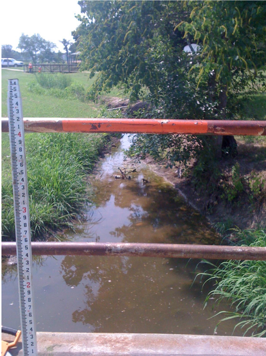
Figure 3. Photo of field survey site 3 illustrating the waterbody characteristics typical of Country Club Branch, Segment 1209D