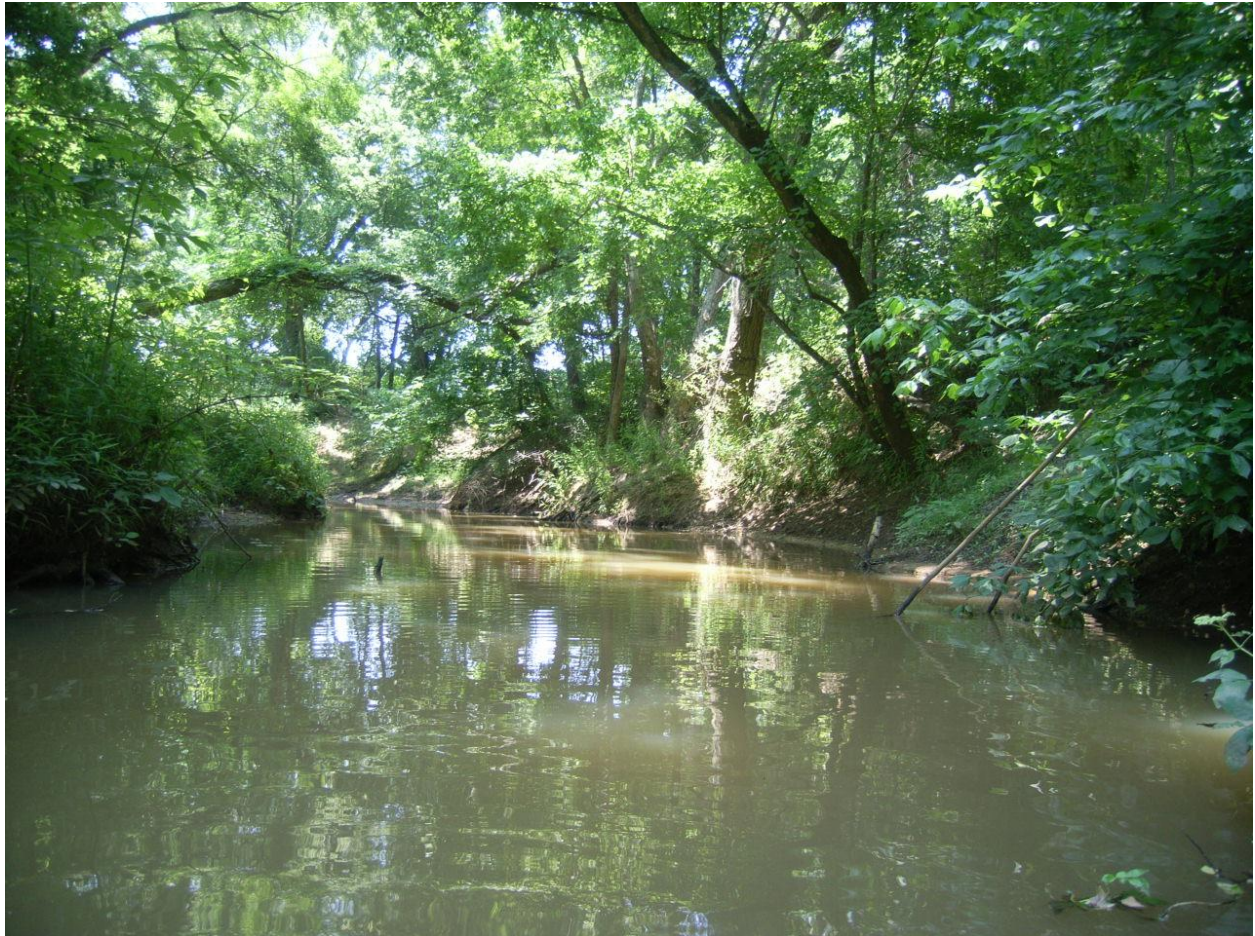
Figure 2. Picture of field survey site 5, showing the general representation of the physical conditions seen on Cedar Creek, Segment 1209G