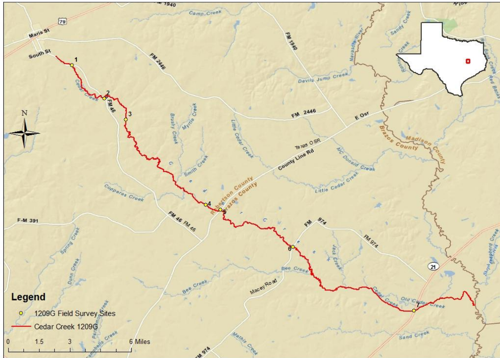
Figure 1. Basic RUAA survey sites on Cedar Creek, Segment 1209G, selections based on river mile/assessment units, accessibility, and recreational features.