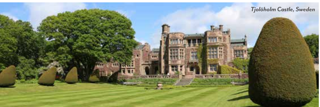
Tjolöholm Castle, Sweden

Latvia's little-known capital is brimming with 18th- and