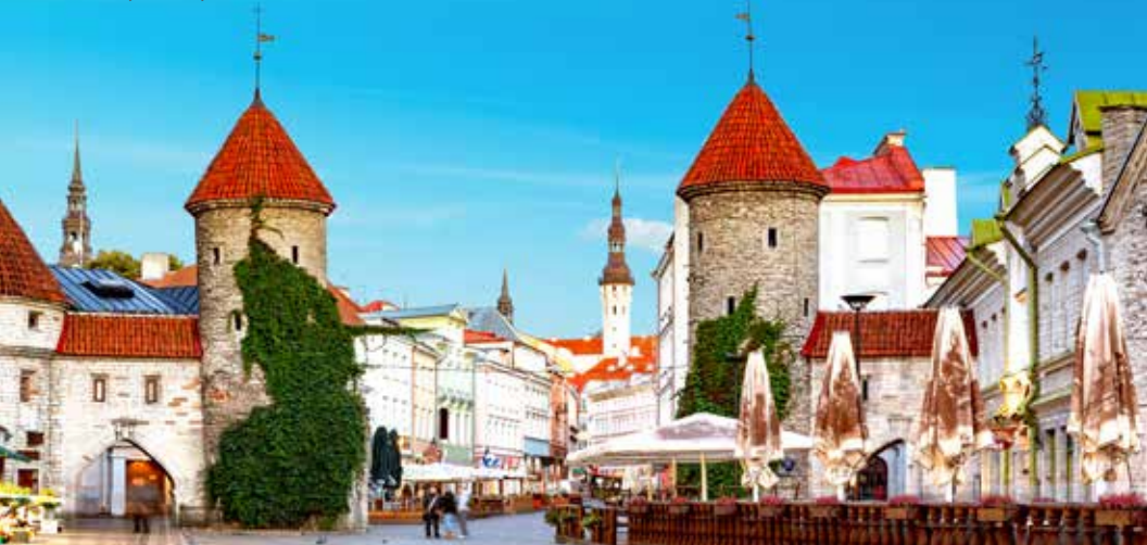
Old Town, Tallinn, Estonia

In his oft-quoted poem, "The Road Not Taken," Robert Frost awakened the idea and determination in many to choose the road less traveled; to overcome fear and avoid regrets. It sparked the quest for adventure in those wishing to experience more from life. Intrepid world travelers manifest this idea by seeking out destinations less traveled, such as Scandinavia and the Baltic Sea, which is surrounded by nine countries in Northern Europe. Here, travelers have the rare opportunity to visit a number of countries and experience a kaleidoscope of cultures in a short period of time when cruising by ship from port to port. Ancient architecture, centuries-old history, storied landmarks, fascinating cities, and breathtaking, romantic scenery provide the perfect backdrop and opportunity to take the road less traveled, which will surely make all the difference.