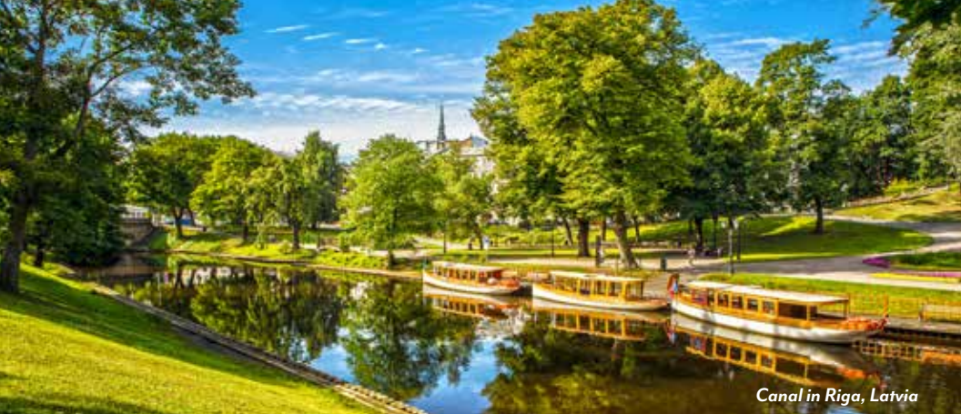
Canal in Riga, Latvia