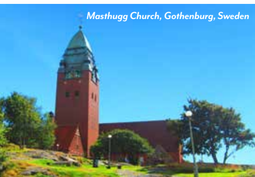
Masthugg Church, Gothenburg, Sweden

After breakfast, transfer to the airport for your return flight home. (B)