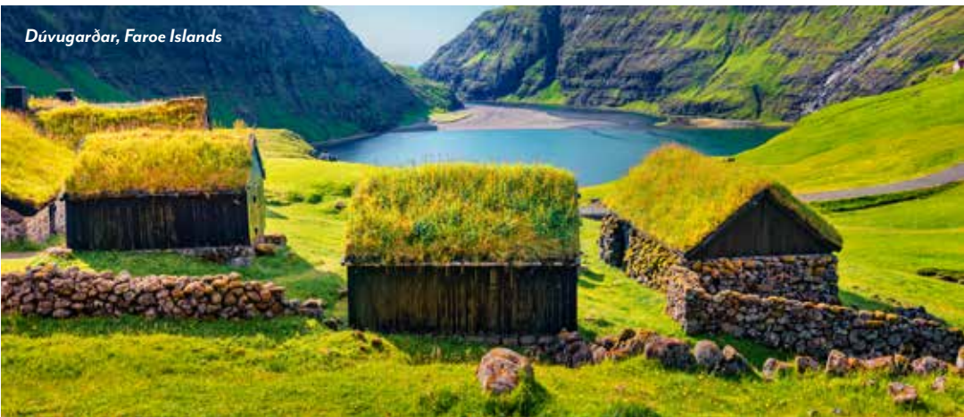
Dúvugarðar, Faroe Islands

Spend today cruising toward Iceland. Enjoy the amenities on the ship, perhaps indulging in a sauna or a dip in the hot tub. Spend some time on deck with a book or watching the horizon. Savor three delicious meals on board. (B,L,D)