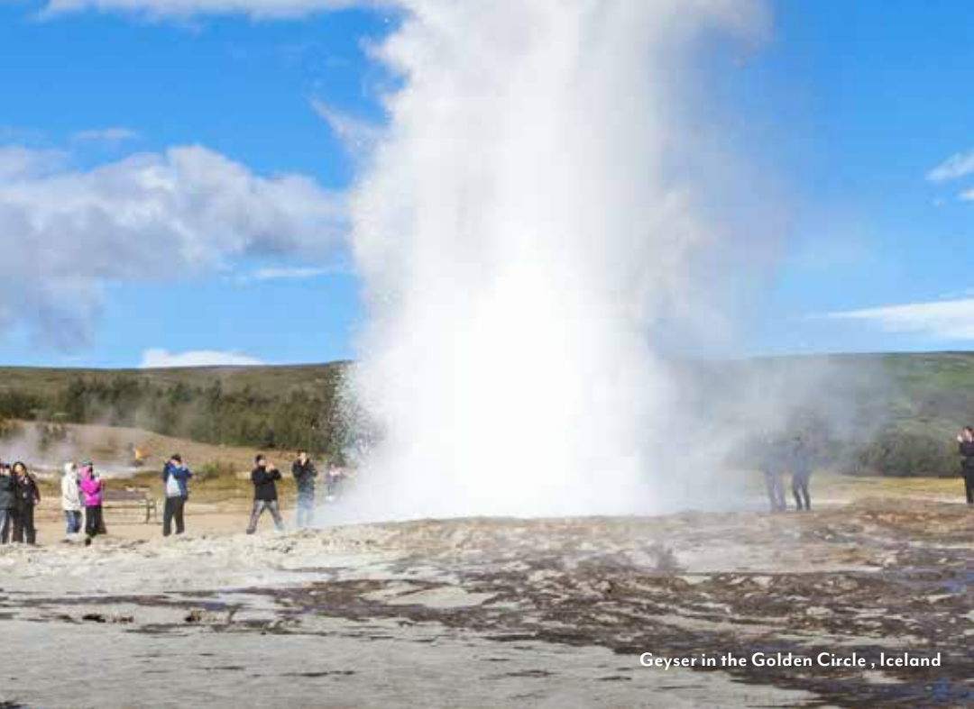
Geyser in the Golden Circle, Iceland

Front cover: Old Town, Tórshavn, Faroe Islands, Denmark