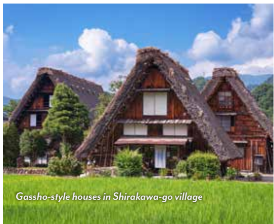
Gassho-style houses in Shirakawa-go village