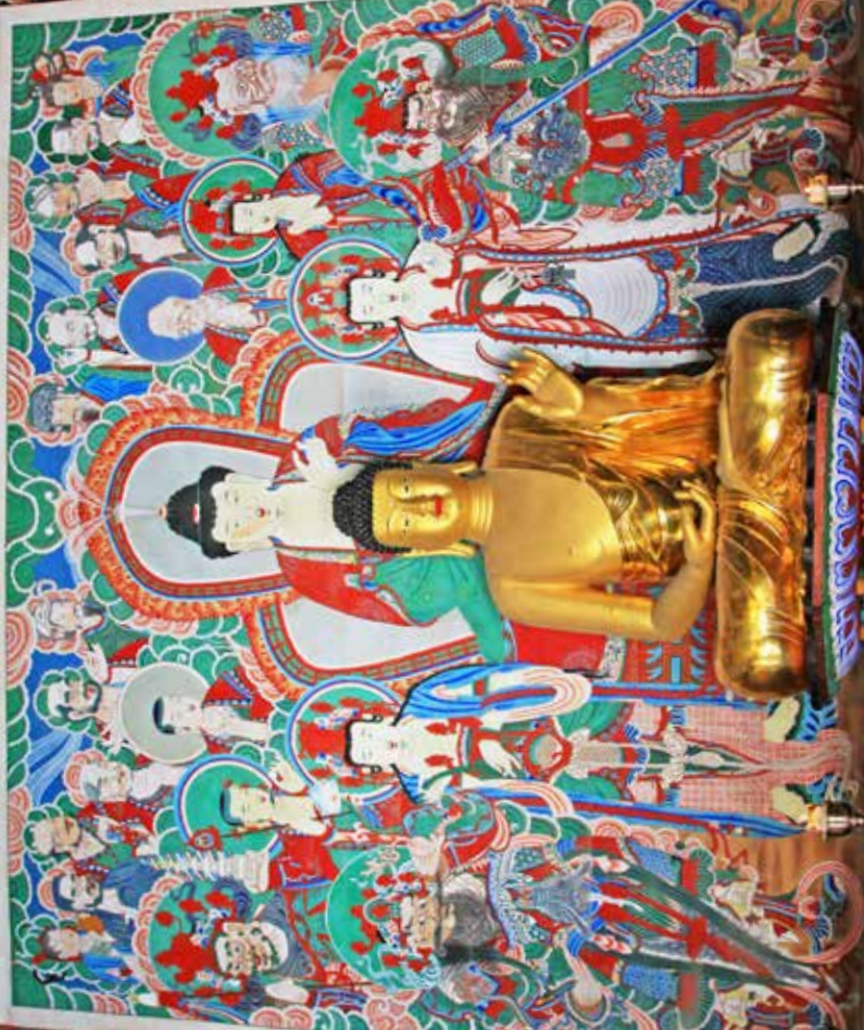
Bulguksa Temple, South Korea

PRSR7 STD U.S. Postage PAID Gohagan & Company