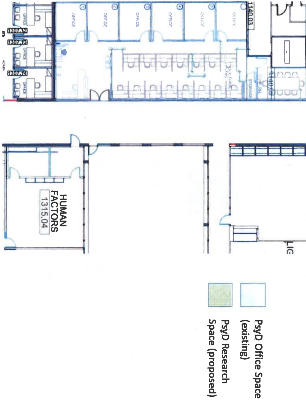
Figure 1. Current Human Factors Lab and Proposed Reallocation located in the Arbor Building